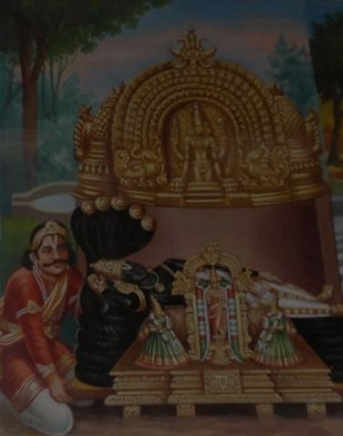
LORD RANGANATHA AT SRIRANGAM