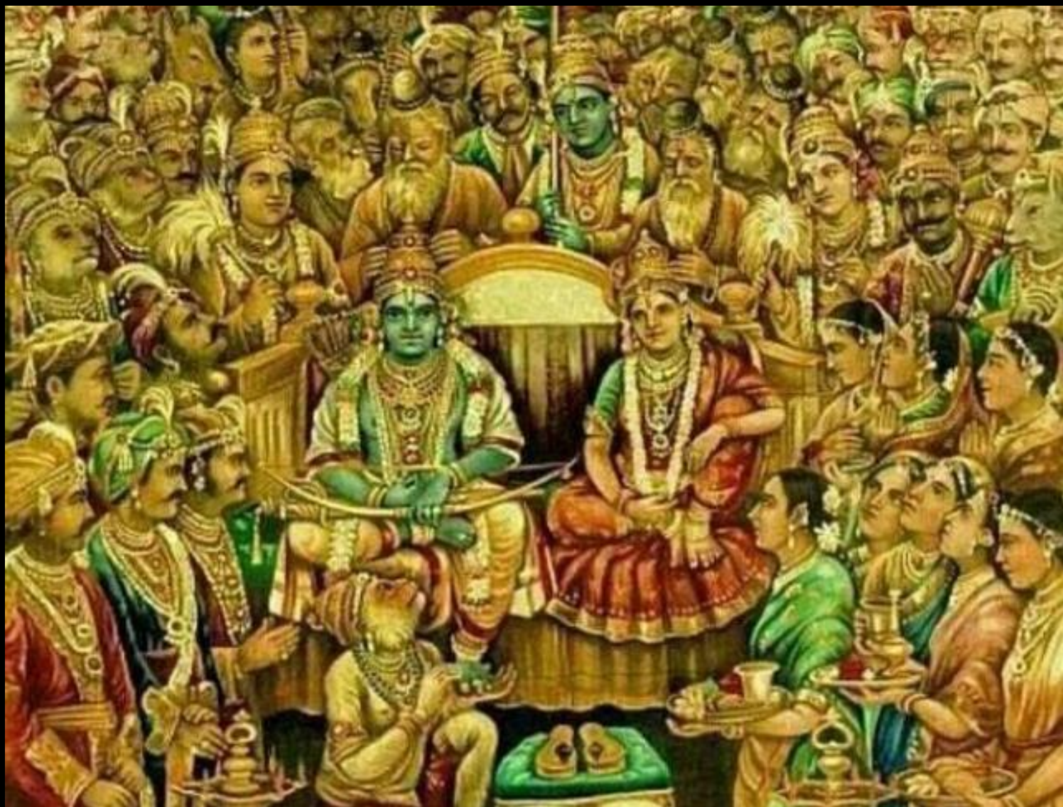
GROUP PHOTO OF RAMA'S PATTABHISHEKAM